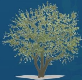
The Jordanian Society for Fertility and Genetics