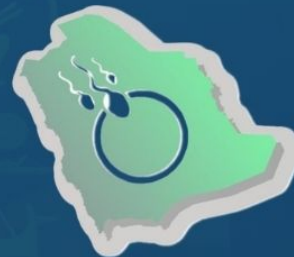
المجموعة السعودية لعلم الأجنة Saudi Arabian Group for Embryology (SAGE)