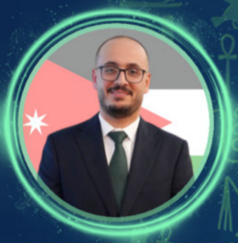
SA'ID AHMAD NASRALLAH